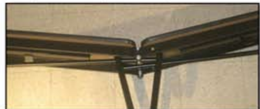
Anti-Jackknife Children Safety