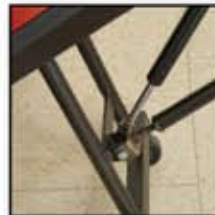
Bench Hydraulic Lift Assist Operator Friendly