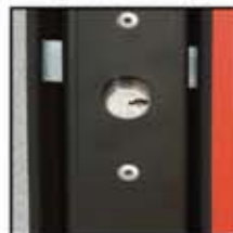
Key Post Locks An Extra Measure of Security