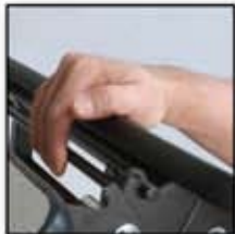
Automatic Downlock Single Hand Release