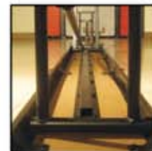
Bench Center Support For Added Strength