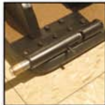
Track Arm Pin Easy Table/Bench Tracking