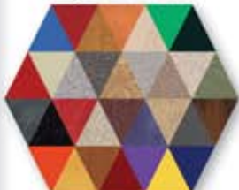
Laminate Color Choices Huge Selection