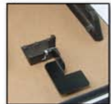
Storage Lock Automatic Locks & Easy Release